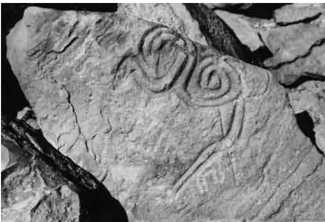
Fig. 3. A snake figure carved on a horizontal stone face, a component of the early Neolithic burial monument in wadi Ti-n-Iblal.