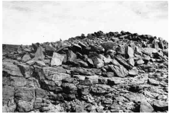
Fig. 6. Large burial mound (30 m diameter) situated outside the wadi near its eastern margin. In the background can be seen the stele.