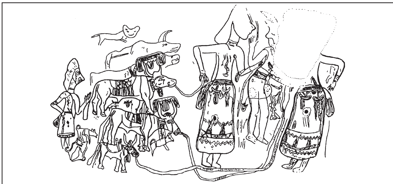
Fig. 1. Wadi Taleschout: a composition representing some kind of important deal between two women in festive costumes and with profusely decorated saddled oxen. A wedding or an initiation ceremony? What was the value of such one prestigious ox?

rywhere we find traces of the coexistence of hunting and animal domestication. Moreover, we find cattle figures earlier than the early bubalus representations (Pesce, 1967; Jelinek, 1985, Muzzolini, 1989). This fact is not influenced by new finds of late Neolithic representations of bubalus surviving evidently in certain isolated regions into much later times (Soleilhavoup, 2000). For already existing pastoralism, the hunting economy in early Neolithic times was a supporting economy within the same population (Jelinek, 2003).