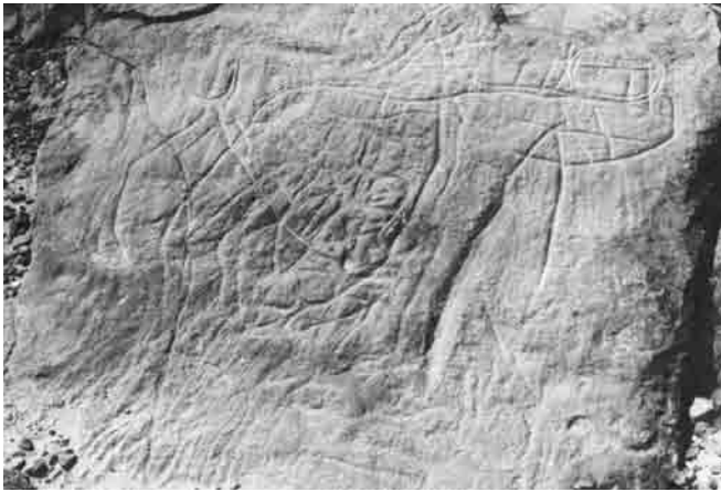
Fig. 5. Another non-figurative carving on a horizontal rock face, another component of the early Neolithic burial monument in Ti-n-Iblal.

Let us now turn to another important social feature, to the burial mounds, their shape, construction and decorative elements. No doubt, the stone monuments in the Sahara represent several other features, like ceremonial or habitation remains. For our purpose here, we focus on the burials only. Starting with the well-known Garamantic burial mounds (Pace, Sergi, Caputo, 1951), thousands of such simple stone mounds are found on the slopes of wadi Ajjal, the once famous Garamantic centre. These were burials of the commoners whereas other, greater and more elaborate monuments were found in certain places, such as, for instance, at the "Royal cemetery" in the side valley near the Old Germa (F. el Rashdy, 1986). Evidently these not so numerous monuments belonged to the Garamantic elite. Social stratification of this settled population was, no doubt, well established.