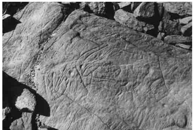
Fig. 4. A non-figurative carving on a horizontal rock face, another component of the early Neolithic burial monument in Ti-n-Iblal.

If we bring together the considerable amount of documentary material, we see that many examples clearly demonstrate the symbolic meaning of this imagery. To illustrate this, for example, there is the case from wadi Djerat, where the engravings show a group of elephants headed by a small young elephant marching erect on its two hind legs (Lhote, 1976). This is certainly not a normal elephant and consequently also not a normal elephant group. There is some symbolic meaning behind the scene, which unfortunately we do not know. If the small elephant did not figure in this group composition we would no doubt consider these elephants as a realistic and not symbolic representation. A similar situation can be mentioned, for instance from In Galghien in the Messak Settafet, where the famous decorative elephant has a small simple theromorphic face hanging on a line from its anus. And this elephant is followed by a small archer with an unusual head, menacing the elephant from behind. This is again a complex symbolism not only because of the kind of associated figures but also for the fact that in normal life conditions there is no chance for an archer to endanger such a pachyderm. Such examples are quite frequent if we study the Central Saharan imagery thoroughly. Certainly we know of some narrative, some decorative and some other examples of exceptional engravings, but we see that the majority of representations has some kind of symbolic meaning.