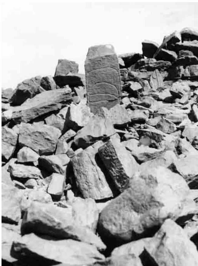
Fig. 7. Detail of the stele with the archaic oval signs.

Their real function should be verified archaeologically. Van Albada found 18 such monuments, ranging from 1 to 5 m wide, in one site in the northern part of the Messak Mellet. The datings of similar features from wadi Tilizahren (4915±80 B.P.) and from I-n-Habeter (5213±80) pose the question of their relationship and/or function compared to the large prestigious burial monuments of middle to late Neolithic nomads.