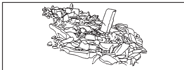
Fig. 9. Wadi Taleschout : another large burial mound (after van Albada, 1995).

After the early existence of ceramics and the domestication of animals in the central and southern Sahara, the develop-